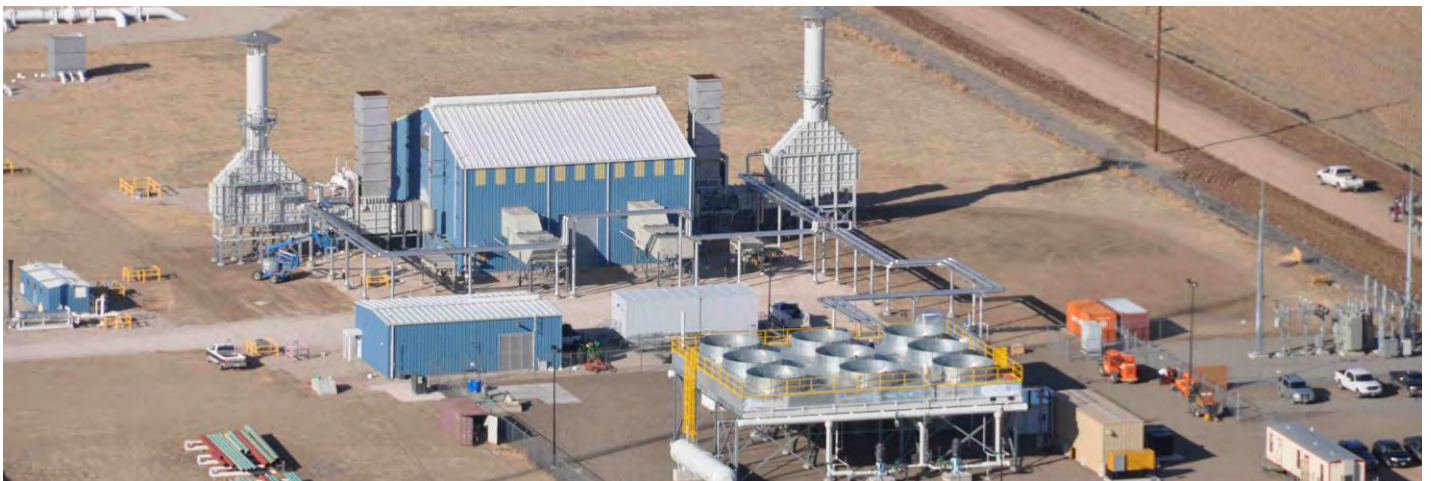
Trailblazer Recovered Energy Project in Northeastern Colorado

ENVIRONMENTAL BENEFITS: 27,600 tons of CO 2 , 34,500 kg of NO x , and 124,200 kg of SO 2